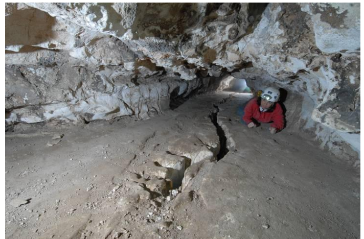
Fig. 1 – Passage with discharge slot at the floor and different levels of wall convection niches.

Sulphuric notches with flat roof, linked to lateral corrosion of the thermal water table, carve the cave walls at different heights recording past stages of base-level lowering.