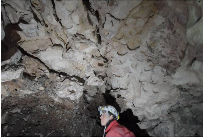
Fig. 2 – Replacement pockets partially covered by gypsum crusts.

Gypsum deposits have been found in many parts of the cave. Replacement gypsum crusts are common in many passages; the gypsum is located in large vertical fissures along the walls, it can partially cover wall convection notches, or replacement pockets (Fig. 2). A gypsum body of about 50 cm of thickness was found on the floor of the biggest room in correspondence of which small ceiling cupolas are associated on the roof. Finally, centimetric euhedral gypsum crystals grew inside mud sediments.